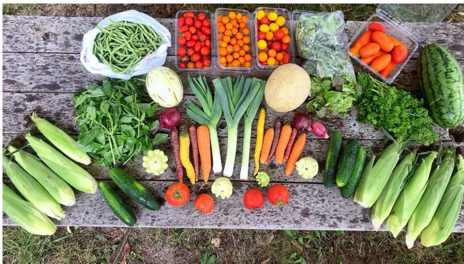
Produce from a vegetable share

The folks at Springdale take their care for God's creation seriously, and in that care they take time to educate and share the love. Through the CSA, farmer's markets, and supplying lots of folks with fresh veggies, Springdale has a strong community presence. When I found out that they were losing their kitchen space to make fresh soups, I asked if they needed a new space. A few kitchen upgrades and an inspection later, we are now the new home to Springdale Farm's kitchen. Cindy and Gretchen are here on Mondays and Wednesdays making delicious and healthy soups that fill the building with some pretty amazing smells. If you happen to be around, feel free to stop by and say hello. I am excited to see how this partnership with St. Paul's and Springdale Farm grows.